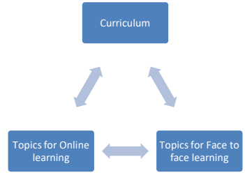
Fig.4. Complexity Based Model of Blended learning

We are proposing a model that is based on curriculum complexity (see fig. 3 and 4). In this model team of subject experts will divide the curriculum into portions suitable for online learning and traditional classroom learning. The subject topics well suited for online learning will be taught online and topics suitable for face to face learning will be delivered traditionally. Experts will take into account the capability of the learners or students and their pace of learning also for customization of curriculum .online learning can also be used to supplement rather replace classroom learning for certain topics which students are not able to understand properly by traditional classroom teaching methods .Curriculum customization is the critical step in this model and can be improved by taking students into confidence and by taking inputs from preliminary student assessment scores test their preliminary knowledge. Assessment of learner participation and feedback from learners can result in instruction well suitable for independent mode of learning. Student assessment can be achieved by conducting routine performance tests, grading and scoring methods to assess success of teaching learning methods used. Student participation can be assessed by using student login methods.