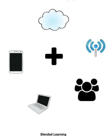
Fig.2. Overview of Blended Learning